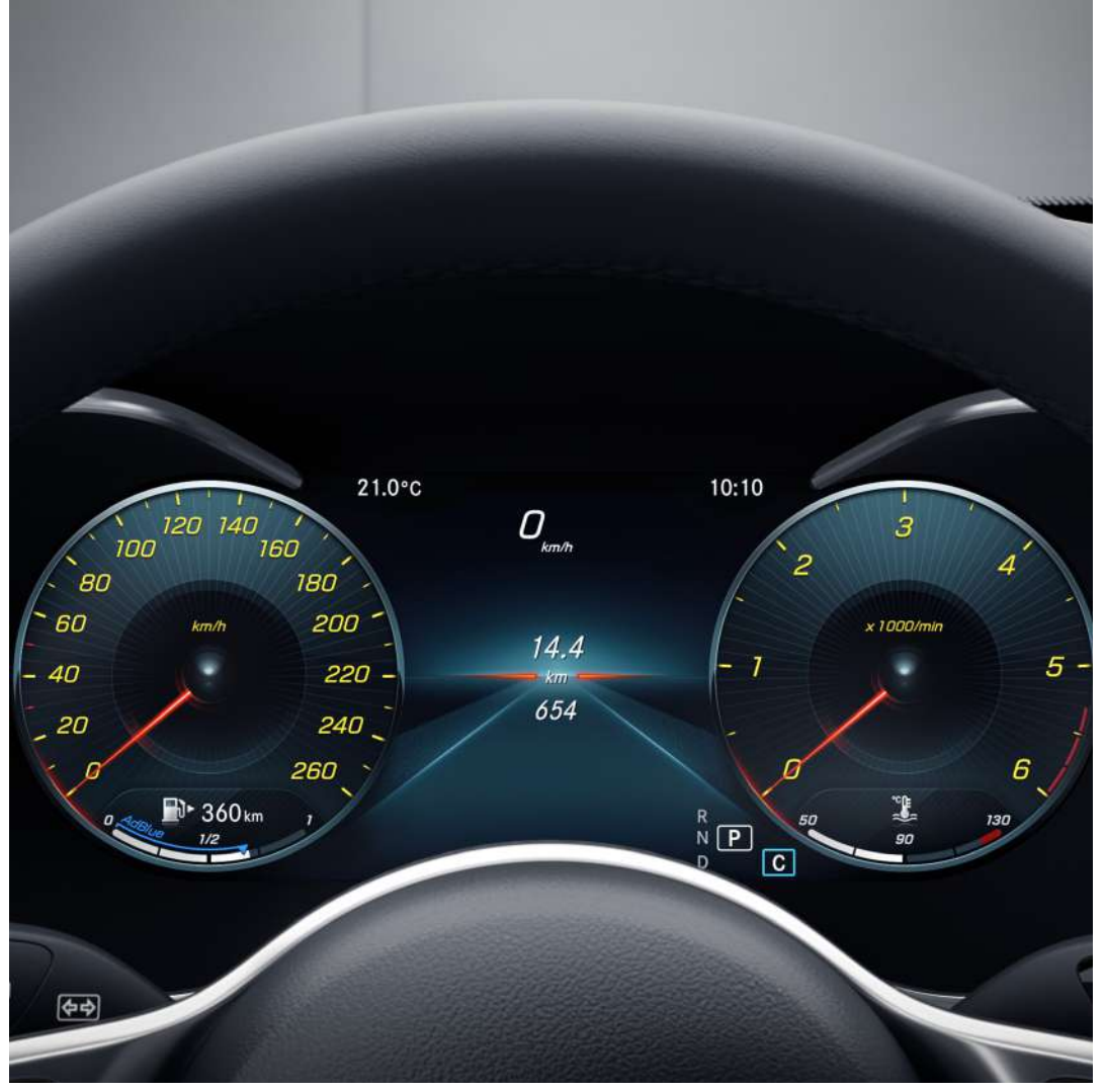
All-digital instrument display