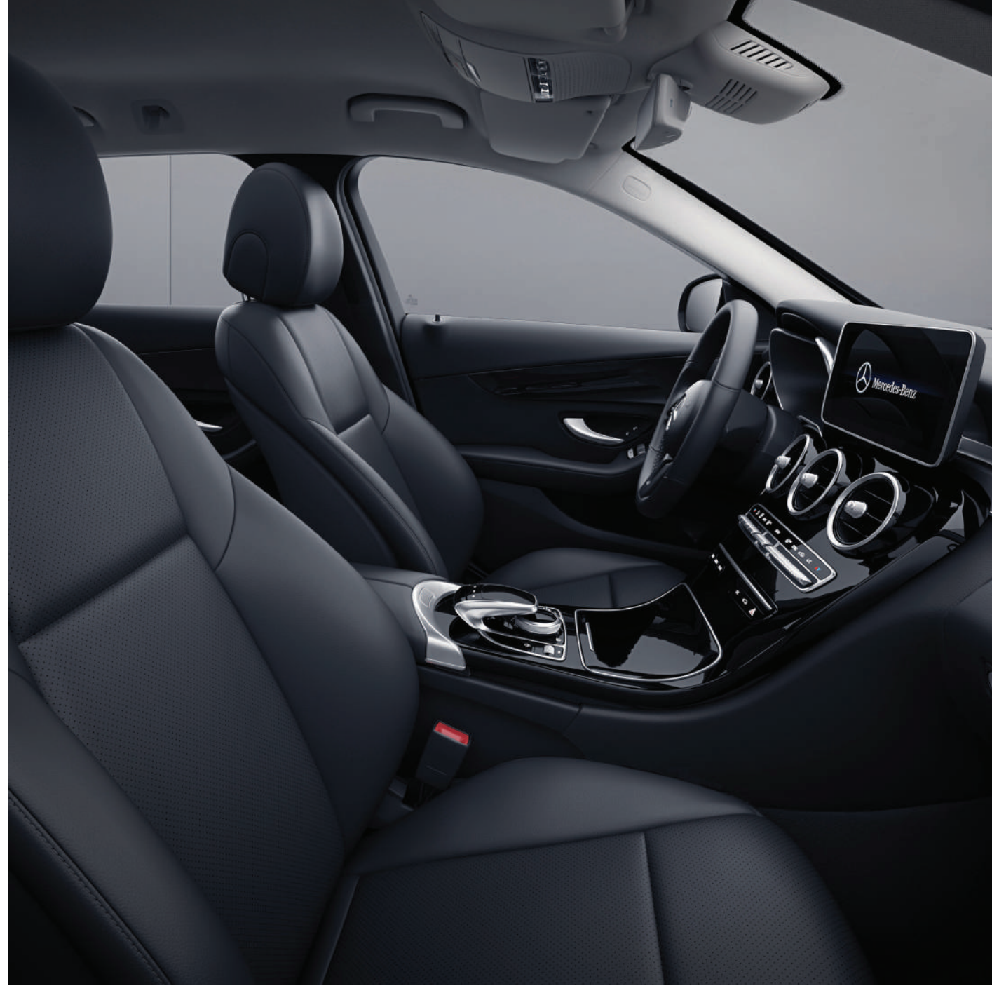
C 180 Avantgarde Interior

Multifunction sports steering wheel in leather