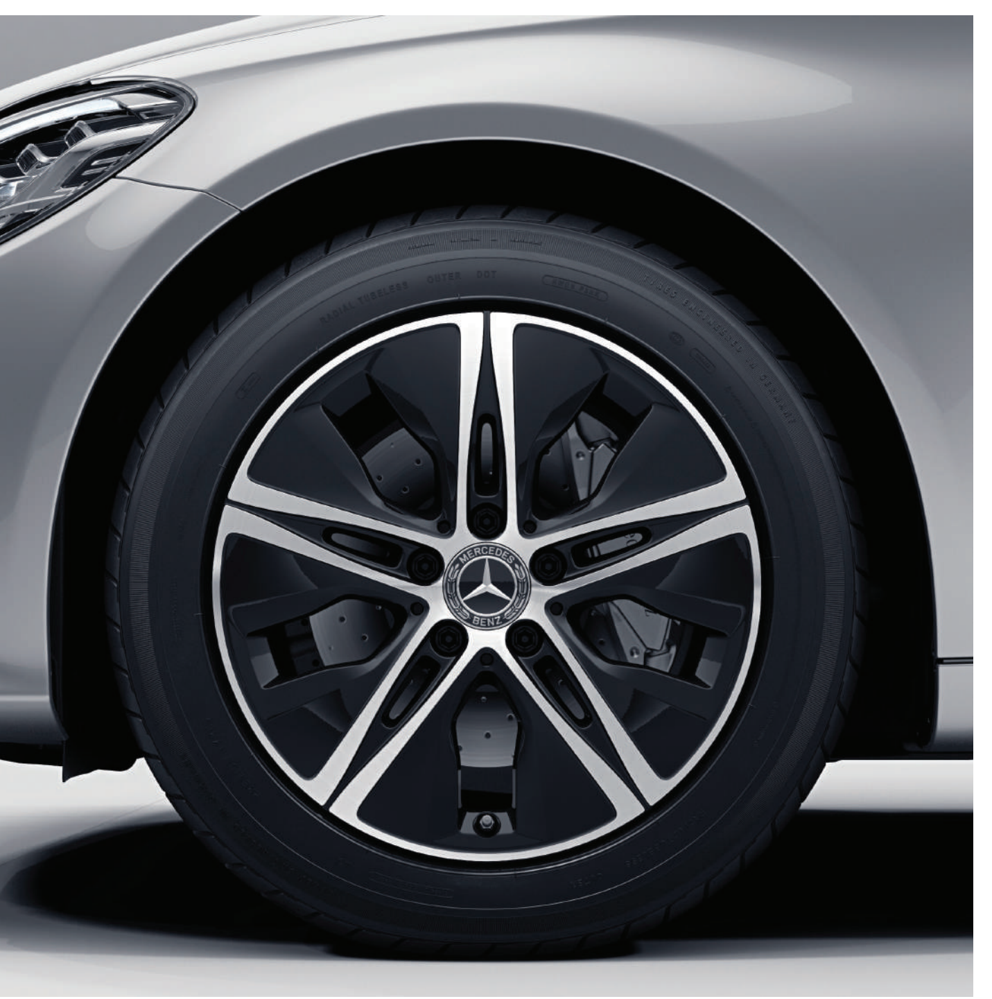
Avantgarde Exterior (Front)