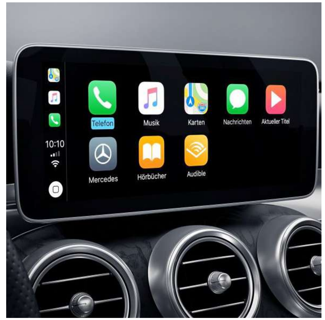
Android Auto and Apple CarPlay™